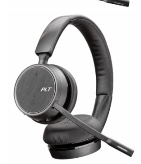
UCF IT Telecommunications

For questions or support, contact the UCF IT Telecommunications Service Desk