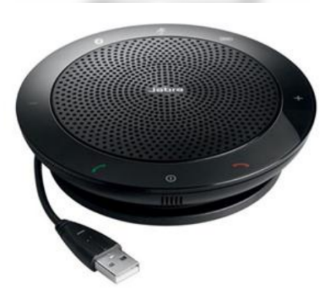
UCF IT Telecommunications

For questions or support, contact the UCF IT Telecommunications Service Desk